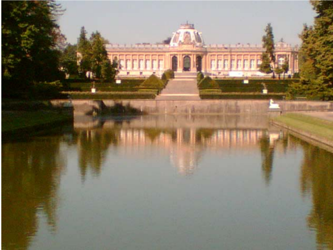
Royal Museum for Central Africa, Tervuren, Belgium